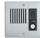
IE-JA Door station.